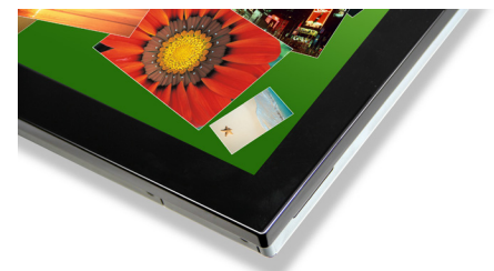
Flat Front Surface