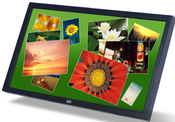
32-inch 3M™ Multi-Touch Display C3266PW

The C3266PW display also features a premium LCD with 1080p Full HD resolution for sharper images, LED backlights for enhanced color brilliance, reduced power consumption, ultra-wide 178 degree viewing angles for consistent views throughout the exhibit, and a 120Hz refresh rate that ensures digital content maintains sharp even when in motion. The premium LCD helped enhance the user's interactive experience by delivering brilliant interactive content and enticing passersby to visit the exhibit.